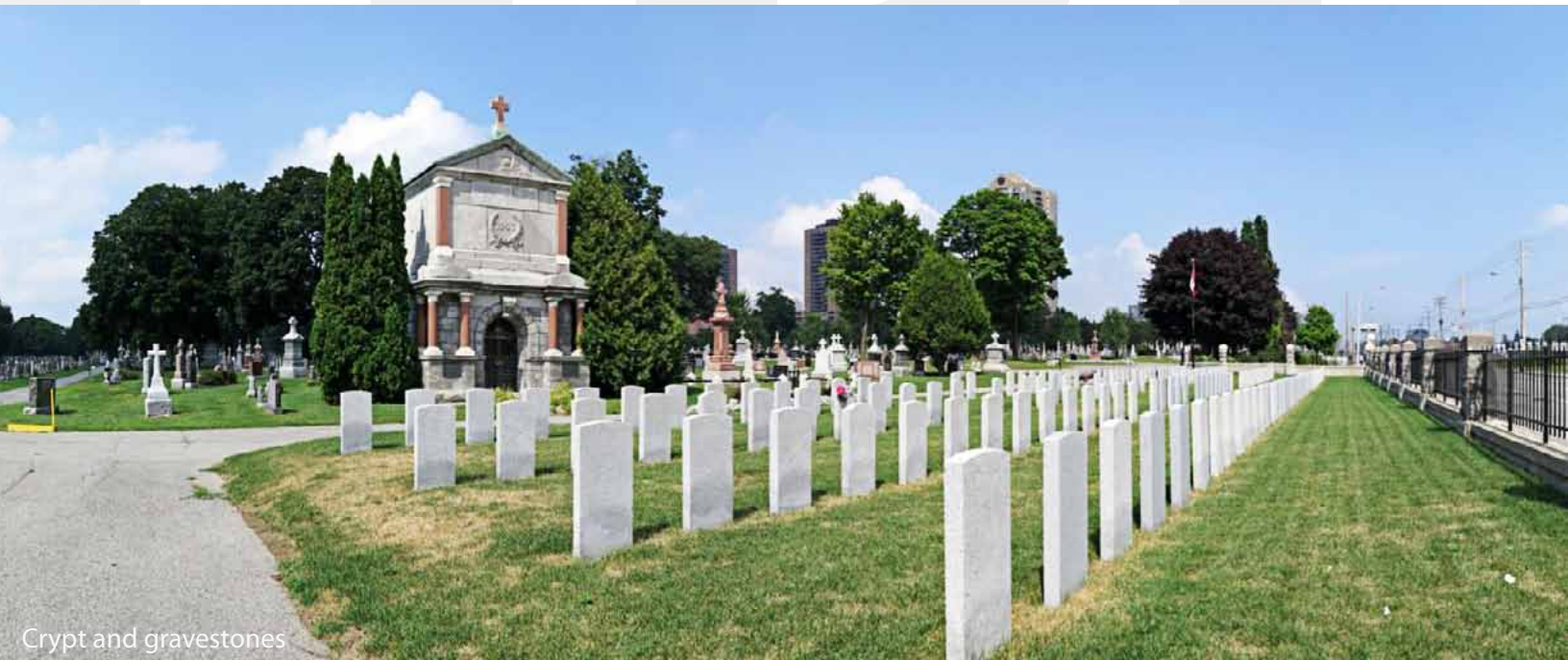
Crypt and gravestones