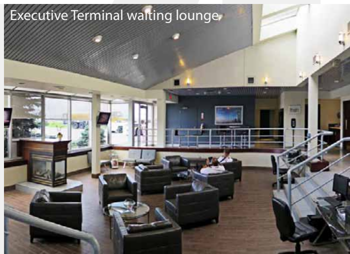
Executive Terminal waiting lounge