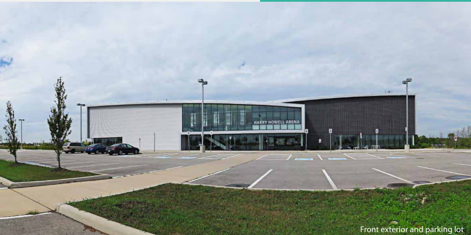
Front exterior and parking lot

Contact: Hamilton Music & Film Office | film@hamilton.ca | 905-546-4233