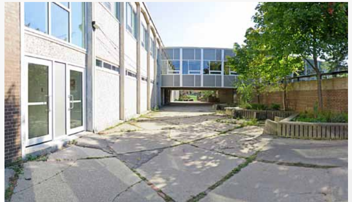
(Above: Exterior of Dr. J Edgar Davey Elementary School; breezeway of Dundas Valley Secondary School) Exterior of Westdale Secondary School