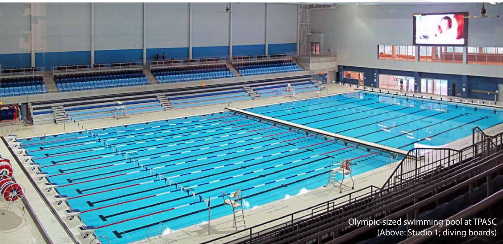
Olympic-sized swimming pool at TPASC (Above: Studio 1; diving boards)