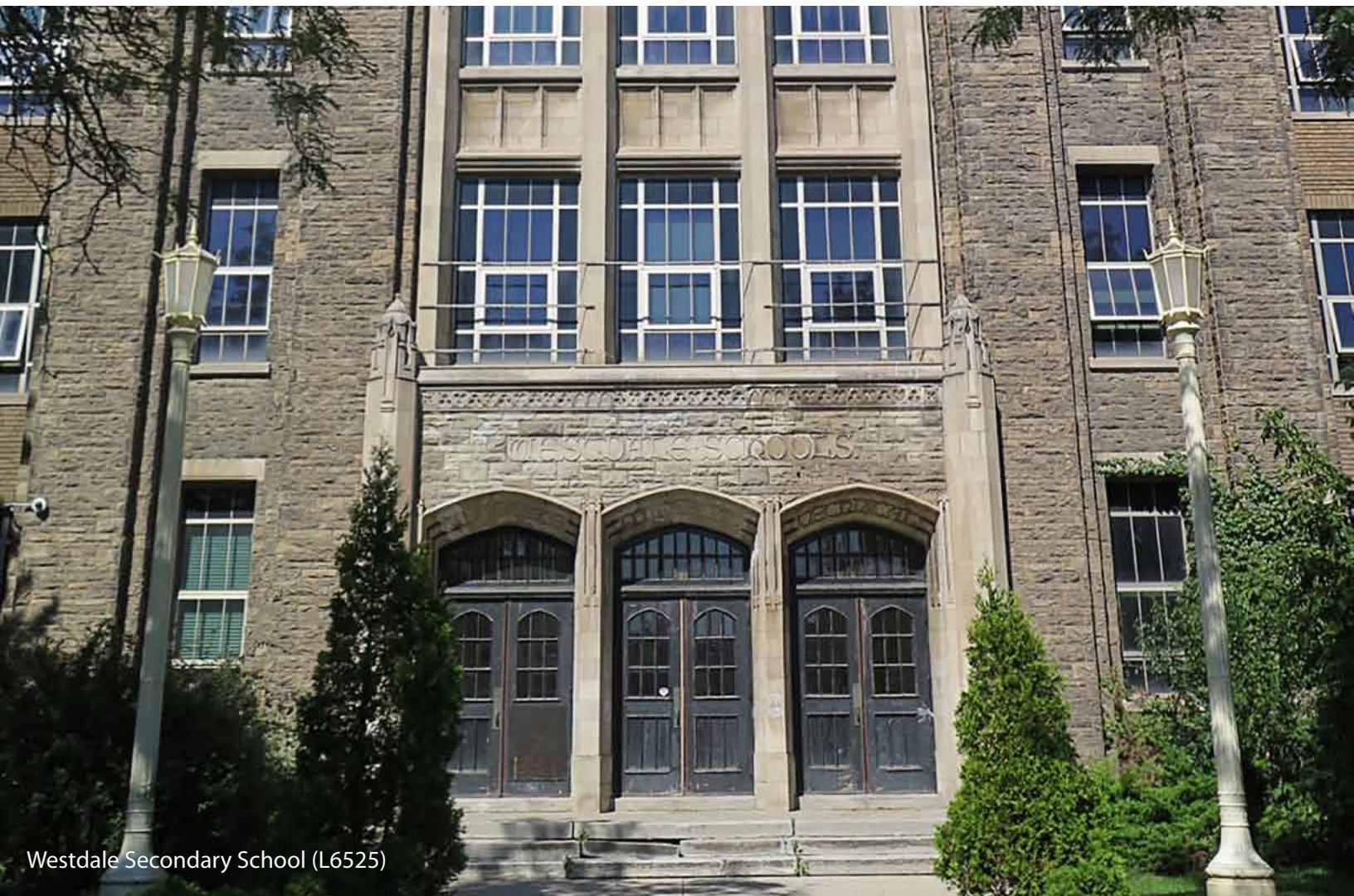
Westdale Secondary School (L6525)