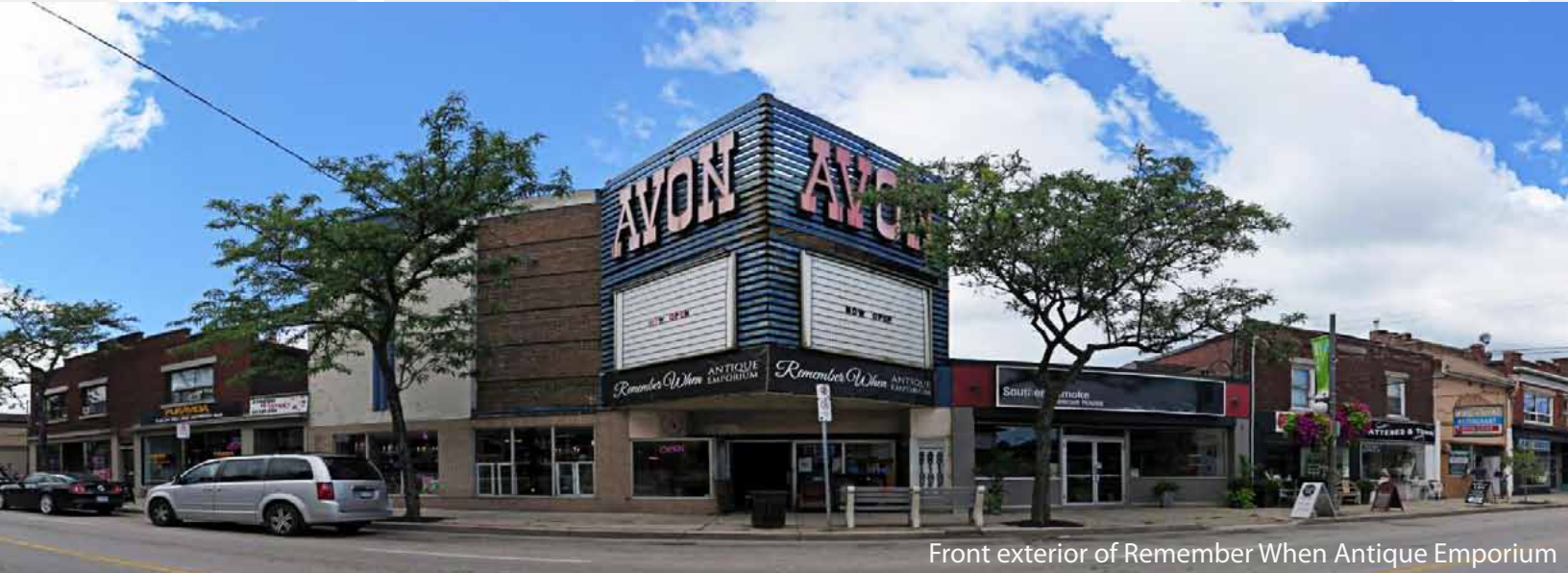
Front exterior of Remember When Antique Emporium